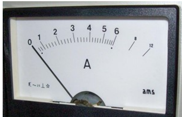
Figure 3: An ammeter and a circuit diagram showing the symbol for an ammeter