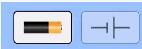
Figure 1: Buttons to change between working with either pictures or symbols